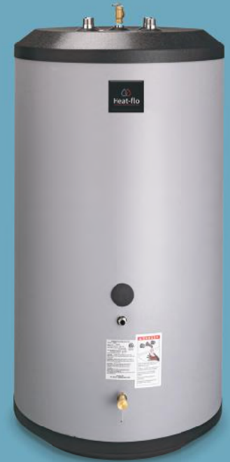
HF-80-ST / HF-115-ST HF-80-ST-C / HF-115-ST-C