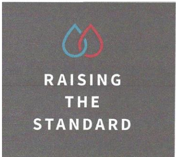
DIMENSIONS & CAPACITIES