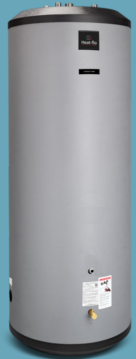
HF-80-ST / HF-115-ST HF-80-ST-C / HF-115-ST-C HF-80-ST-C-2 / HF-115-ST-C-2