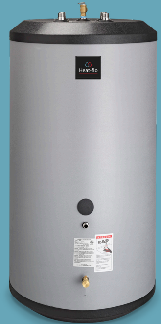
HF-80-ST / HF-115-ST HF-80-ST-C / HF-115-ST-C