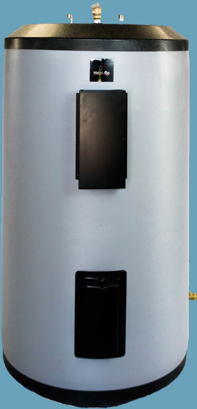
MODELS EC-66 | EC-80 | EC-119